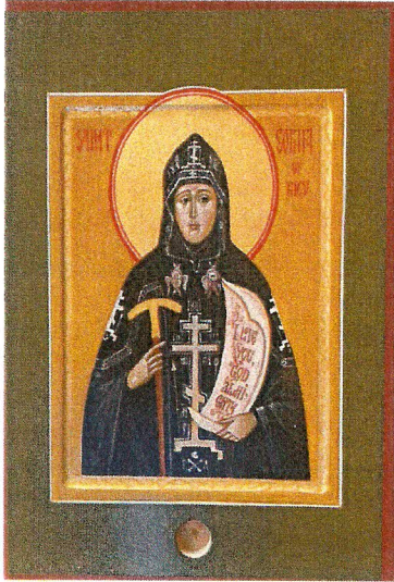
St. Sophia Of Kiev