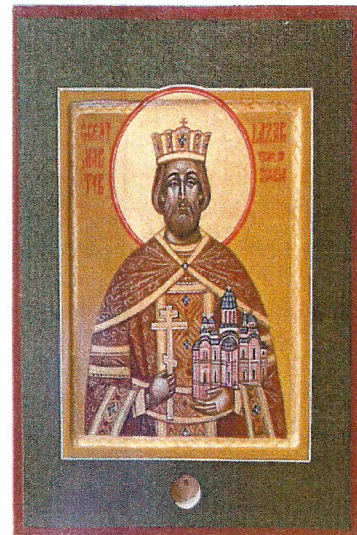
St. Prince Lazar Of Serbia

Her fame grew in the realm of the Church, until the Russian Communists arrested her and sent her from one Prison to another, and she finally reposed in the Lord on April 4 th 1941.